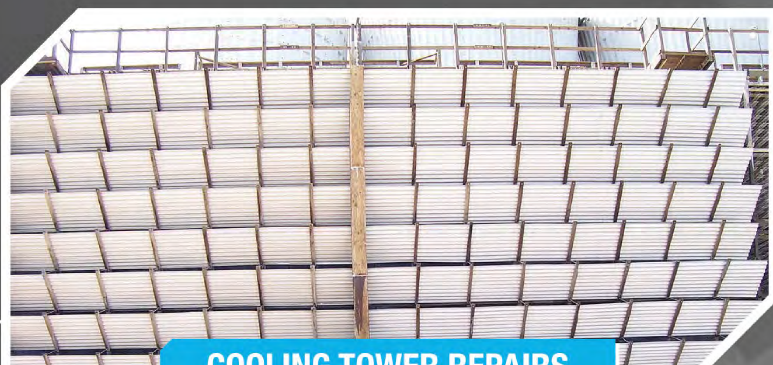
COOLING TOWER REPAIRS

Cooling Towers of Texas utilizes the highest quality pressure treated Redwood lumber, Douglas fir lumber, plywood, fiberglass and stainless steel hardware in performing repairs. Use of quality materials along with competent crews and professional installation ensures the structural stability of your cooling tower while greatly extending its service life. Products such as Amarillo gear reducers, Addax drive shafts and Hudson high efficiency fan assemblies are used by Cooling Towers of Texas in performing mechanical repairs.