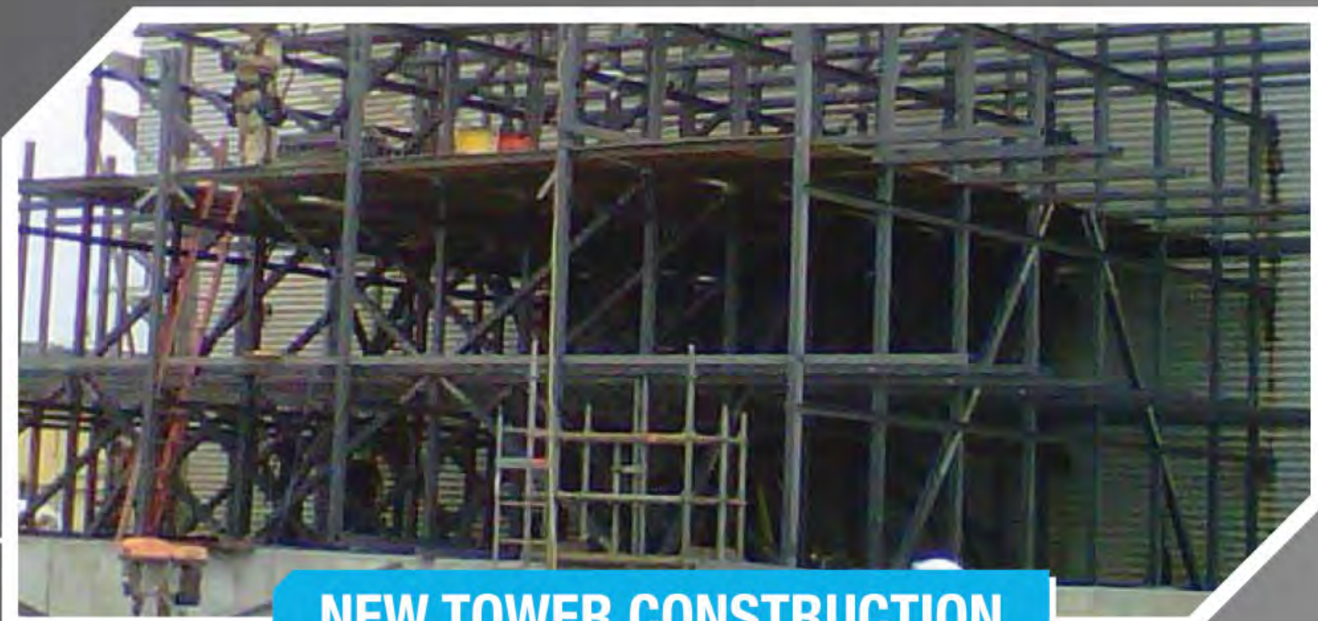
NEW TOWER CONSTRUCTION

Cooling Towers of Texas provides all necessary services for designing (thermal and structural), procuring, and installing new cooling towers. We also offer both packaged towers for commercial applications as well as field-installed towers for larger, industrial applications. With the necessary thermal performance evaluation tools to select the cooling tower design that maximizes the thermal performance offered while satisfying space, economic, and environmental requirements associated with the project.